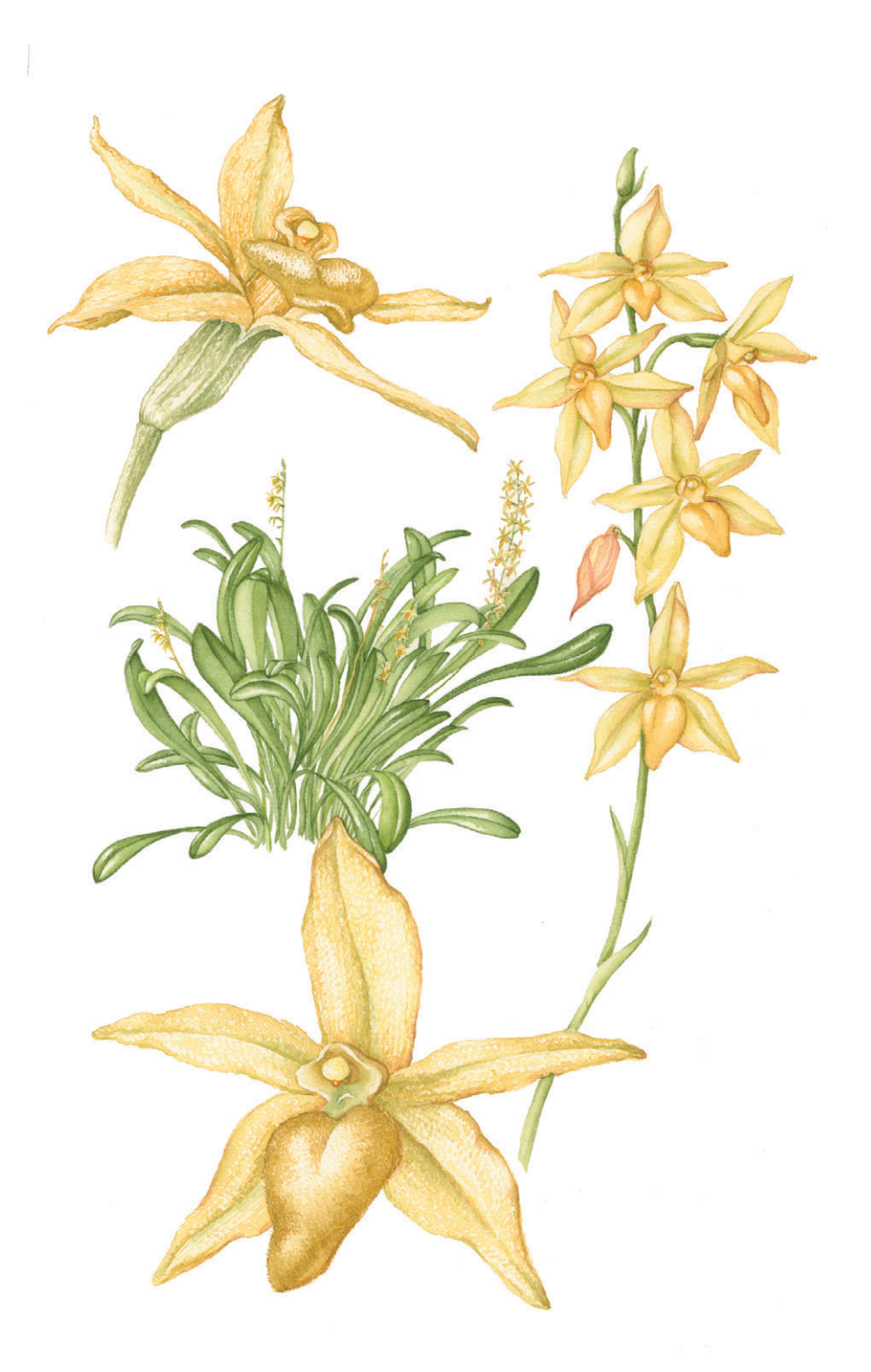
Plate 849 Platystele ovatilabia